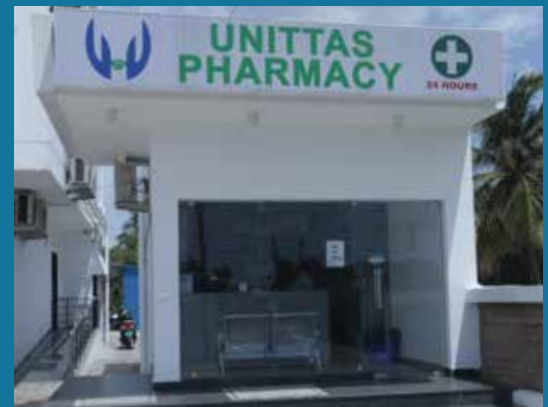
24 X 7 PHARMACY