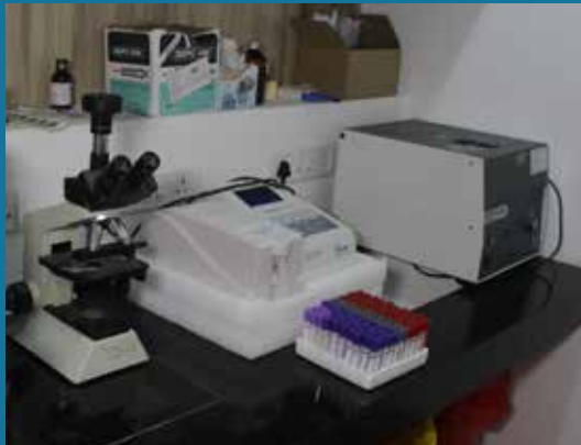
24 X 7 LABORATORY