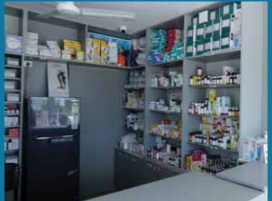
24 X 7 PHARMACY