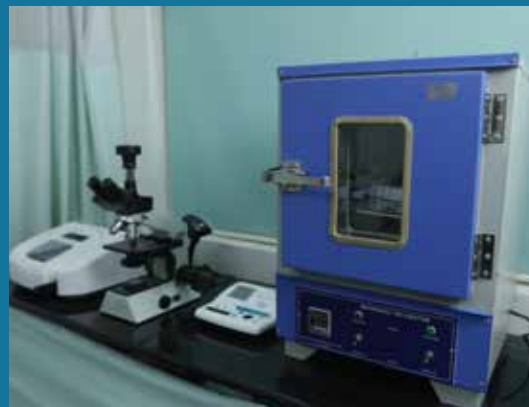
24 X 7 LABORATORY